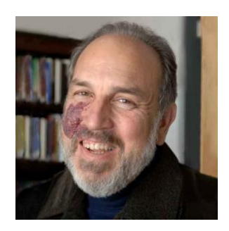
Lawrence Susskind Professor, Department of Urban Planning

winds using geochemical measurements of stalagmites, lake deposits and marine sediments and interpreting these records in the light of models and theory, he aims to offer data-based insights into the patterns, pace and magnitude of past hydroclimate changes. His primary tool is measurements of uranium-series isotopes, which provide precise uranium-thorium dates for stalagmites and lake deposits and allow reconstructions of windblown dust emission and transport using marine sediments.